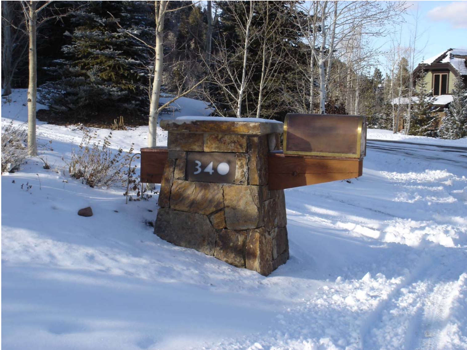
MCC Mailbox Standard 002.JPG 11/28/2007 3:21:48 PM